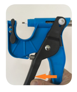
3. Remove the used needle from the pliers by pushing the handles apart. This will loosen the needle and make it easy to remove. You cannot reuse the needle as it has no red plunger.