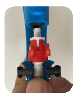
2a. And insert the TSU as shown in the picture