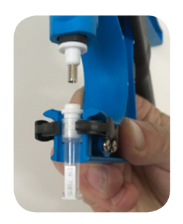
2a. Remove the TSU tube from the pliers by squeezing the two spring loaded clips together, then slide out the tube.