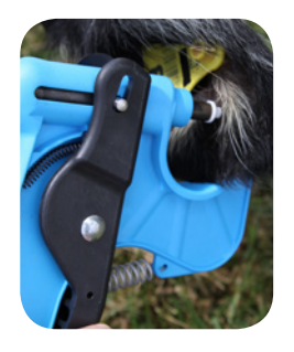
1b. Try to avoid large veins and ridges. The sample should be taken in a very swift, fluid motion.