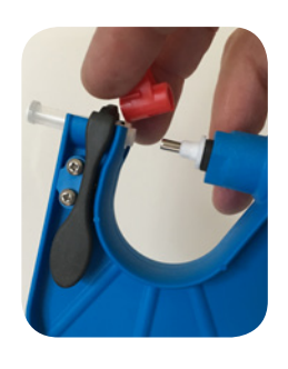
4. You can now easily remove the red connection piece while holding the two red tabs and pushing sideways