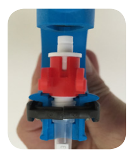
2b. After insertion of the TSU release the spring loaded clips to lock in the tube