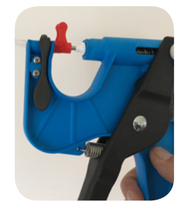
3. You have now completely grabbed the needle. After the needle is inserted into the piston you can release the handles