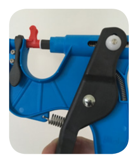
2c. Carefully squeeze the plier handles until the large piston comes to a stop against the red connection piece