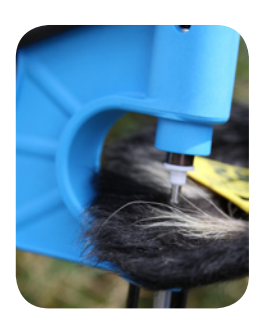
1a. Slide the charged pliers over the ear and position the cutter about 1cm to 2cm from the edge of the ear.