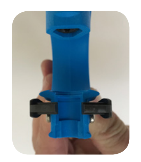
2. Squeeze the two spring loaded retainer clips together