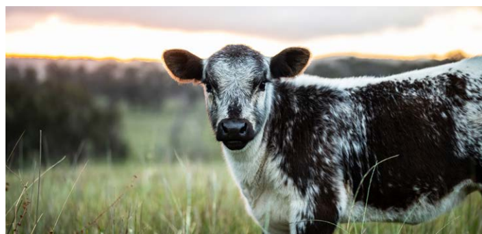
REGISTRATIONS are flowing into the SPI office for 2018-born P-drop Speckle Park calves.

The changeover from the older microsatellite (MiP) technology to Single Nucleotide Polymorphism (SNP) testing opens up doors into genomic testing in the future at lower pricing, and by changing across to SNP