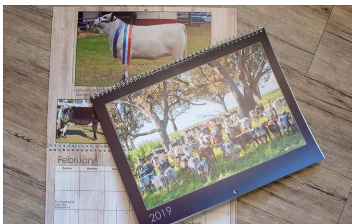
CALENDAR: The '2019 Australian Speckle Park Calendar' was a fundraising effort by two SPI members, with proceeds donated to SPI for application towards a youth project.