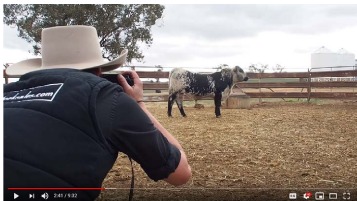
SAY CHEEESE: Photographing seedstock can be made easy with a few key tips to keep in mind.