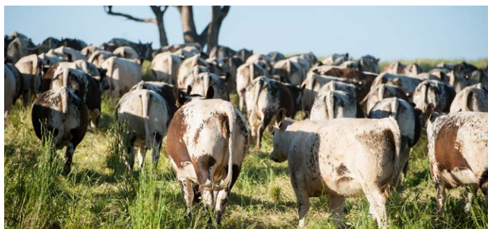
JOIN THE MOB: There has been a rapid increase in membership at SPI. See page 7 for a Membership Snapshot.